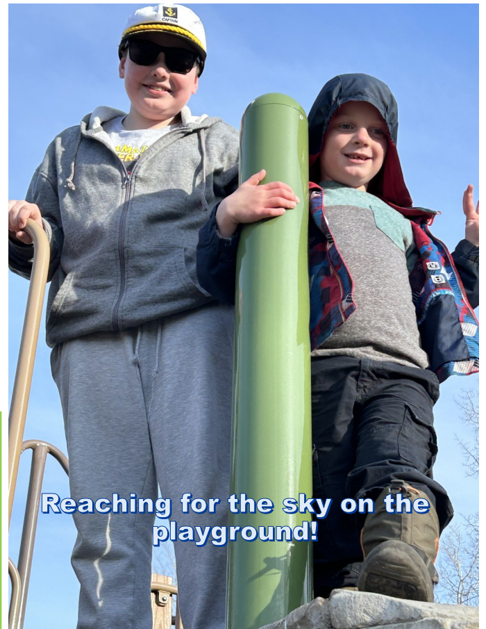
Reaching for the sky on the playground!

Closing date for Out of Catchment applications is Friday, May 15, 2026 . Once the date is passed, all registrations will be in-catchment only.